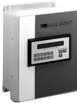
Figure 1. Model 1530AW Mass Flow Computer

Indicates mass rate, mass totalization, flow rate, temperature, pressure, and density. Each function can be accessed quickly and easily through a user-friendly menu system and a help key. Unit is equipped with two totalizers, three process inputs, two control inputs, and five alarm outputs. Program protection with password and memory retention in case of power failure. Designed for use with ideal gas, saturated steam, or superheated steam. Use with Aaliant Target Flowmeters.